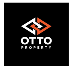
Otto Property Team 1300 688 677