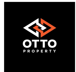
Otto Property Team 1300 688 677