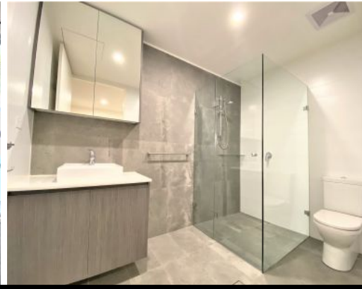
104/904 Pacific Highway Gordon, NSW